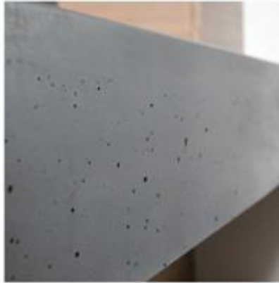
Porosity on Edge